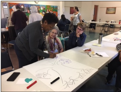
Vista Maria, Dearborn Heights