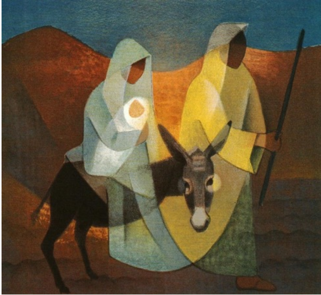
One of 50 cribs from around the world on display at the Good Shepherd Museum in Angers from December 1 through January 14.

The Congregation of our Lady of Charity of the Good Shepherd is an international Congregation of Sisters that is spread across all five continents in more than 70 countries. It is the custom each year for the international Community at the Motherhouse in Angers, France, to display Christmas cribs from communities in different countries.