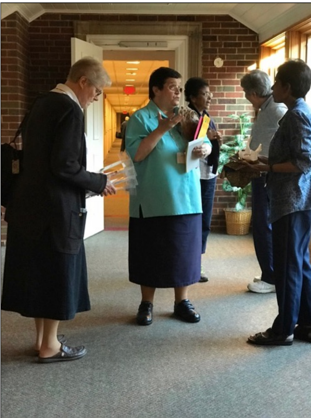
Conversations generated in small groups at Assembly continue into hallways during breaks.