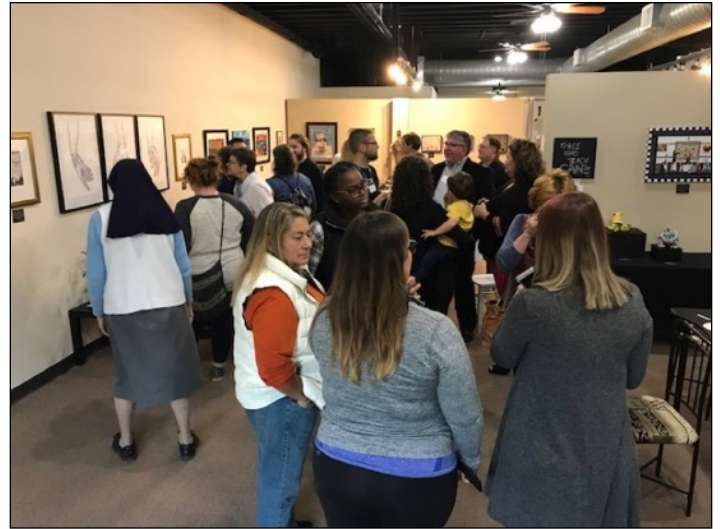
A crowd gathers for the exhibit's opening reception.