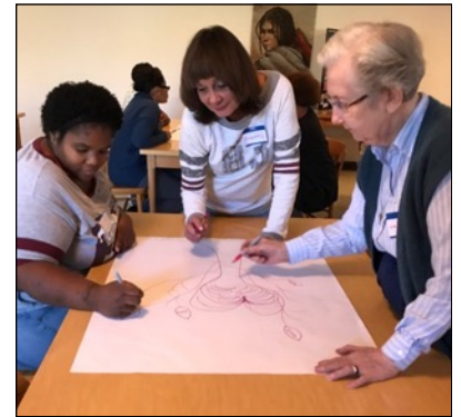
Province Center, St. Louis