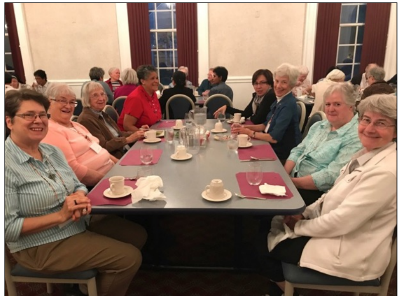
Meals give Sisters from throughout the Province an opportunity to renew friendships, relax and catch up with one another.