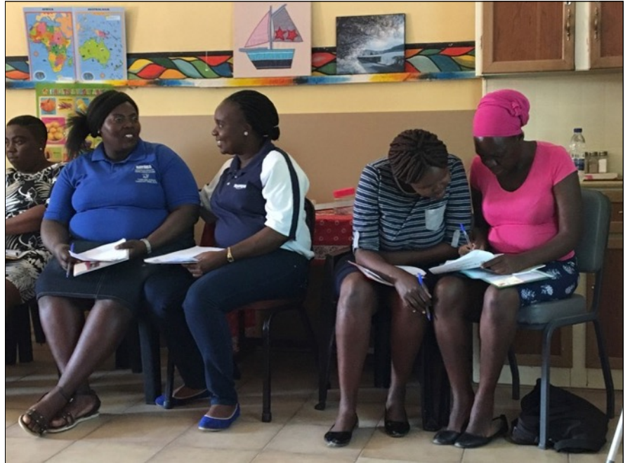
Top: Mission Partners at Mmakaunyane, South Africa, work together on a project during Mission Effectiveness training. Bottom: Children at the Good Shepherd pre-school in South Africa take a break from learning to enjoy a game of sack-racing outdoors.

So how was our trip? It was a privilege to see the Good Shepherd mission being lived out in the lives of such dedicated, committed and loving people.