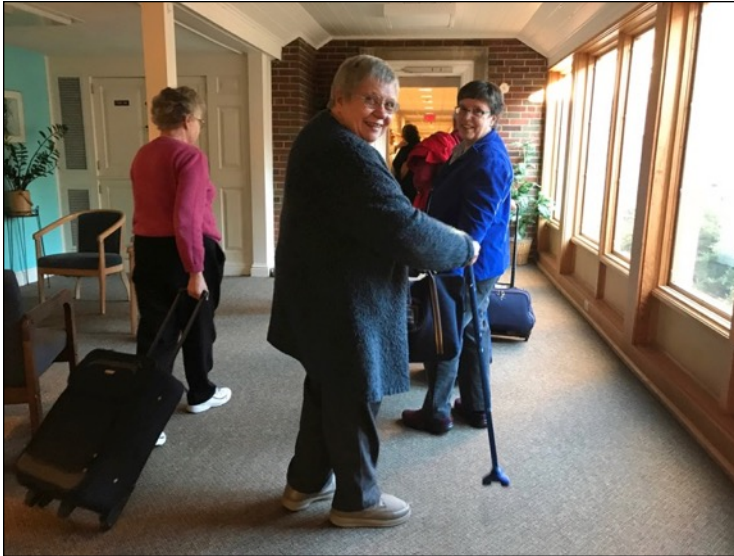
Sisters get settled into their rooms at King's House Retreat Center and prepare for the 2017 Assembly.

our diversity of facial structures, variation of skin colors, hair, and cultures and the beauty of this, the beauty of each person. I sensed within me a deep connection to each one — a oneness. Feeling this sense of oneness was powerful for me. For four days we had intense conversations and shared a vast array of differing points of view. And yet, through that simple and beautiful dance I witnessed how we