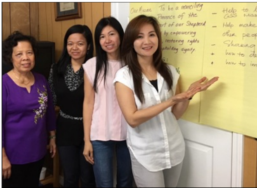
Good Shepherd Services, Atlanta