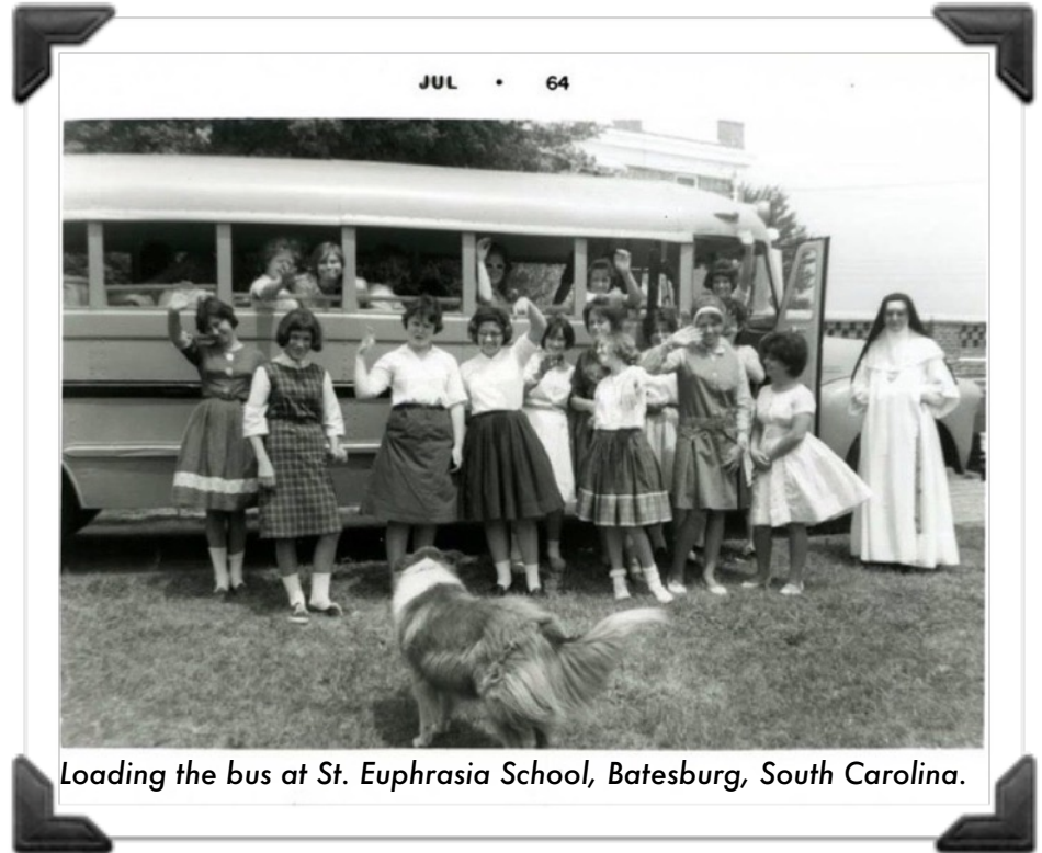
Loading the bus at St. Euphrasia School, Batesburg, South Carolina.