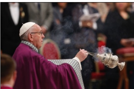
Pope Francis uses incense during a Lenten penance service in St. Peter's Basilica at the Vatican March 17.

I awoke and saw, that life was but service. I served and understood, that service was joy.”