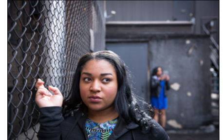
Photo taken on location in New York City during the filming of "I Am Jane Doe."

and fighting back on behalf of thousands of other children who had been sold online.