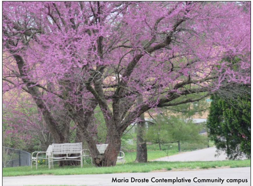
Maria Droste Contemplative Community campus

http://sistersofthegoodshepherd.com/earth-day-evening-prayer/