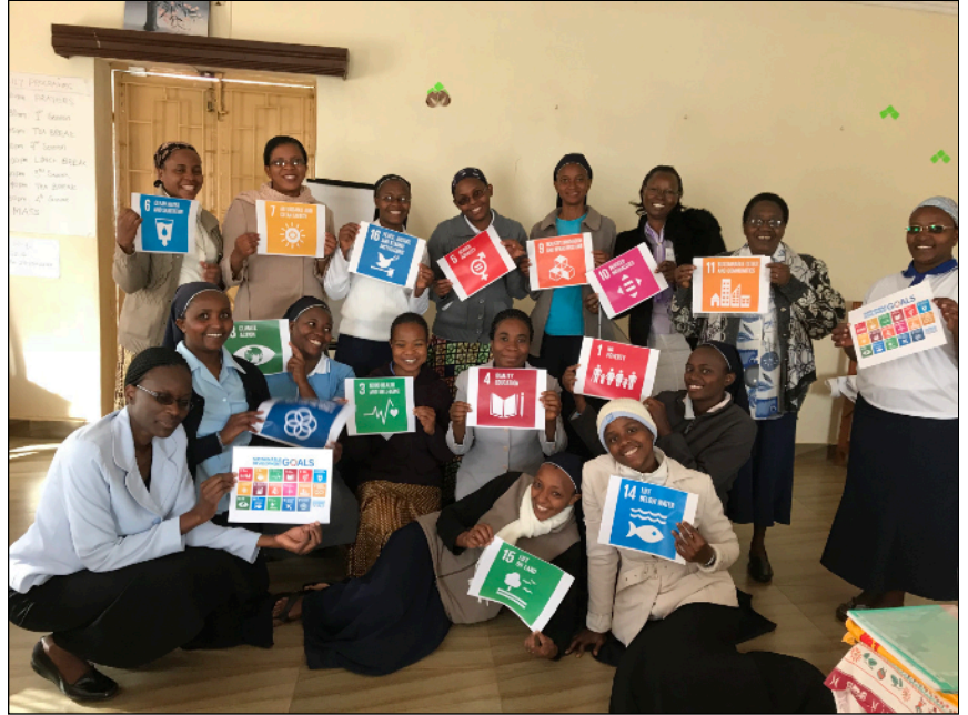
Workshop participants display the UN Sustainable Development Goals.

Sr. Winifred has posted an article about the workshop on her blog at http://bit.ly/2s1xO7p