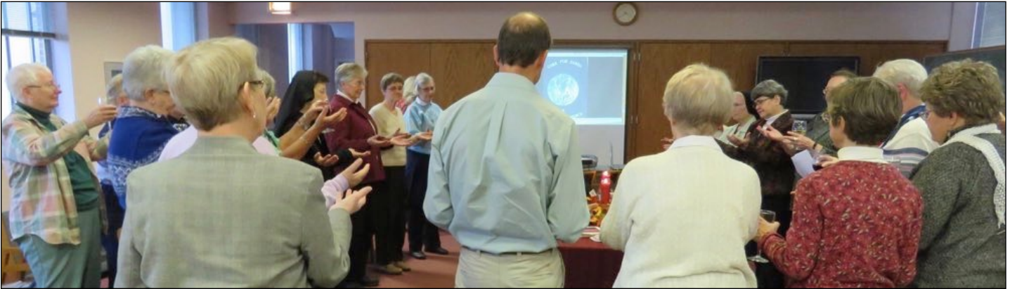
Twenty three communities of women and men religious form the Intercommunity Ecological Council in St. Louis.

IEC has focused on growing understanding of the sacredness of Earth since its inception. The initial activity of IEC was the planting of more than 1,500 trees as a religious act to address climate change. Over the years, IEC members have succeeded in encouraging their congregations to buy fuel efficient vehicles, to stop using bottled water, to compost food scraps from their kitchens and to link Lenten conversion to Care of Earth as ways to add ecospirituality to daily living.