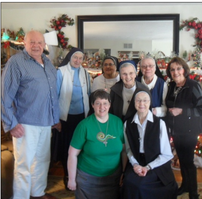
The GSS Baltimore Community visited friends in their home during Christmas.