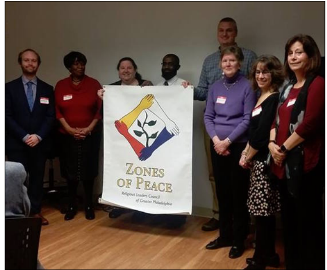
Good Shepherd Mediation Program was recognized as a Zone of Peace at its Open House in December.