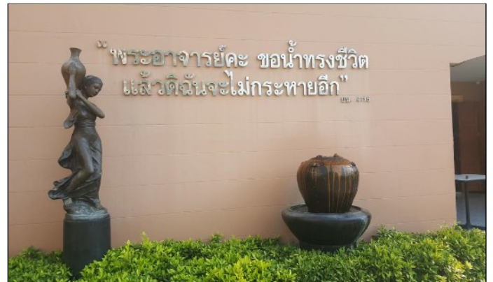
Entrance to the Good Shepherd Fountain of Life Women's Center in Pattaya, Thailand.

The Fountain of Life Women's Center takes its name from the Bible story of the Samaritan woman at the well in John 4:15. The woman asks Jesus to give her the life-giving water he describes.