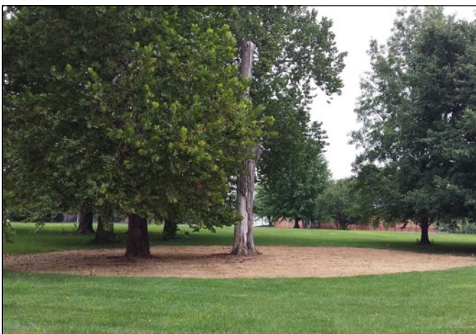
Sisters and volunteers will plant wildflowers for a native habitat area on the convent grounds the morning of September 24. The plantings coincide with the Season of Creation, which runs from September 1 through October 4.