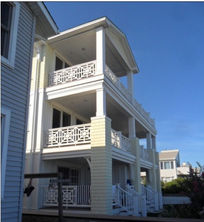
New construction at 3200 Wesley, former site of the Good Shepherd shore house in Ocean City, New Jersey.